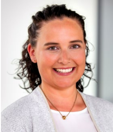
Carolin Huttner Welcome Center